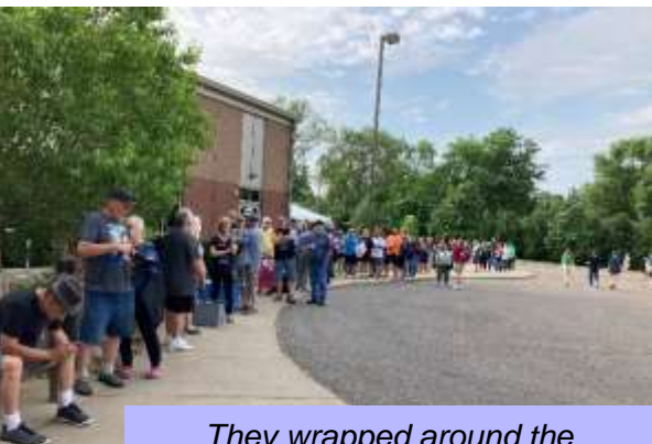
They wrapped around the building, some with bins